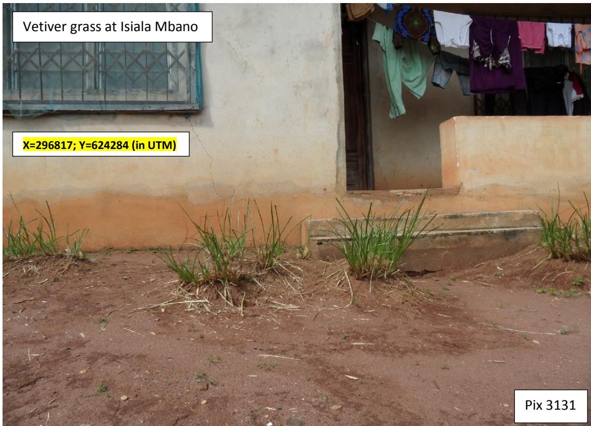
Vetiver grass at Isiala Mbano